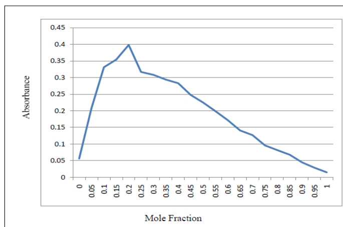
Fig.3 Job's Continuous Variation Method for Ni (II) with NSS in aqueous medium.

A series of solutions were prepared by mixing 0.0 to 10.0 cm 3 of 5.0 x 10 -4 M Nickel (II) solution with 10.0 to 0.0 cm 3 of 5.0 x 10 -4 M NSS solution, such that the volume of each mixture was 10.0 cm 3 each solution was treated at optimum pH as per procedure and the absorbance was then measured against blank. The absorbance values were plotted against mole ratio of Ni (II) to NSS. It shows sharp maxima at 0.2 Mole Fraction of Ni (II), indicating that the colored complex extracted into Ethyl acetate was formed by the reaction of Ni (II) and NSS in the ratio 1:4.(Fig.3)